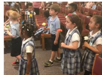
Photos from our May Crowning on Wednesday